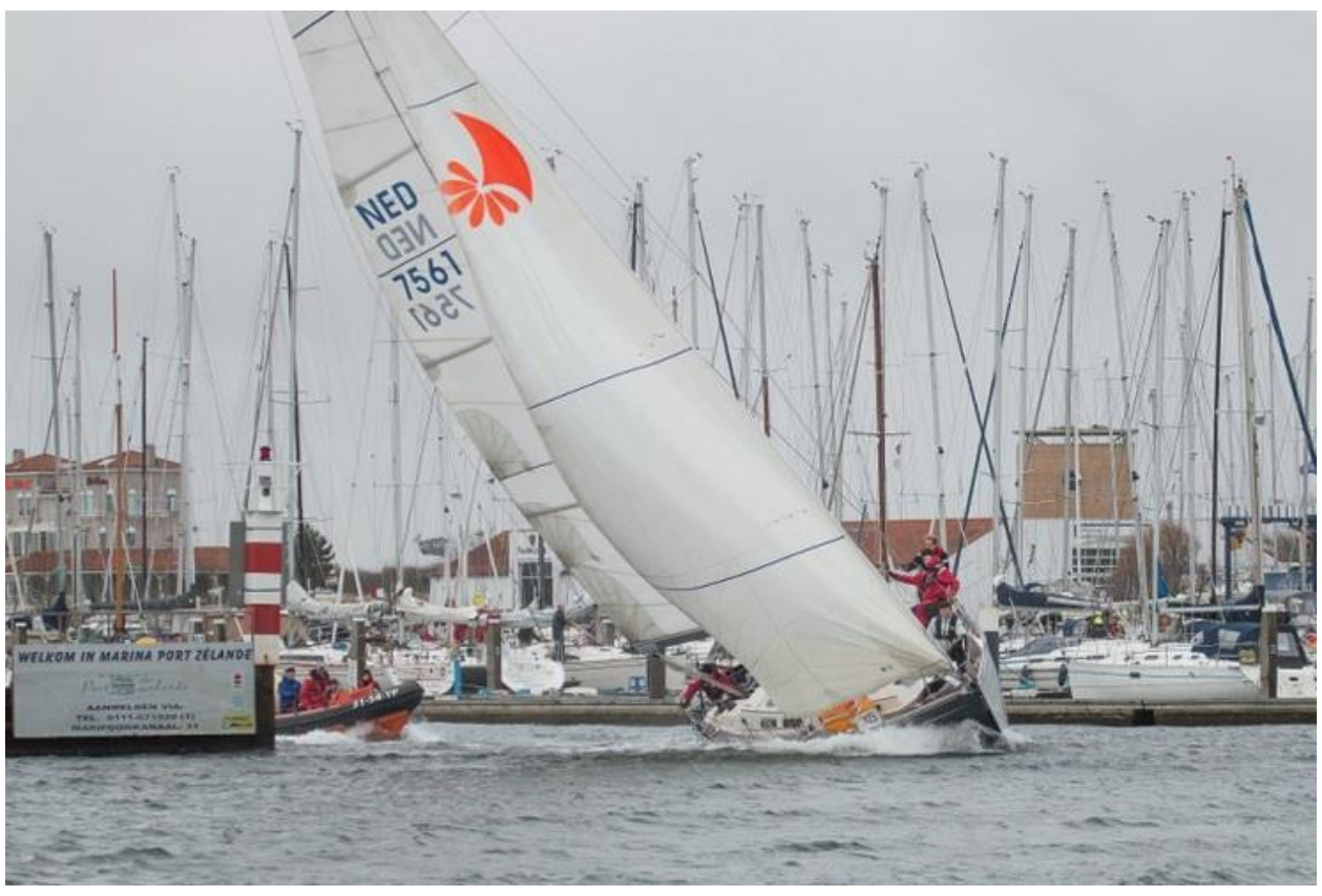
Marina Port-Zélande: a homeport for cruiser & racing crews as well as for dinghy racing