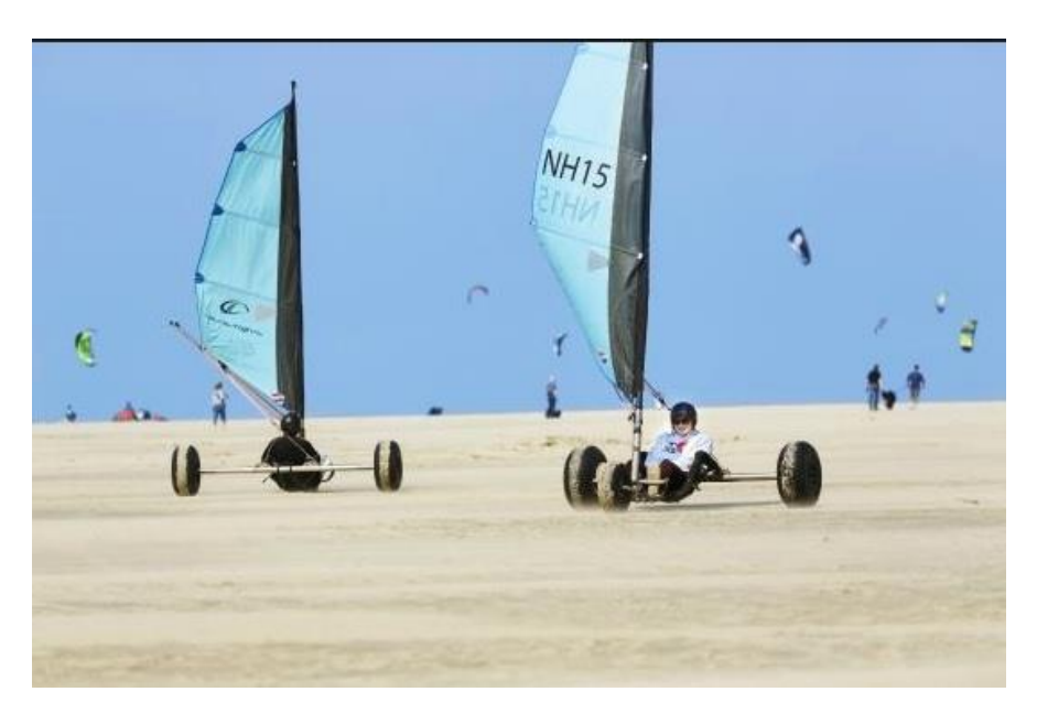
Sail carts / beach sailing