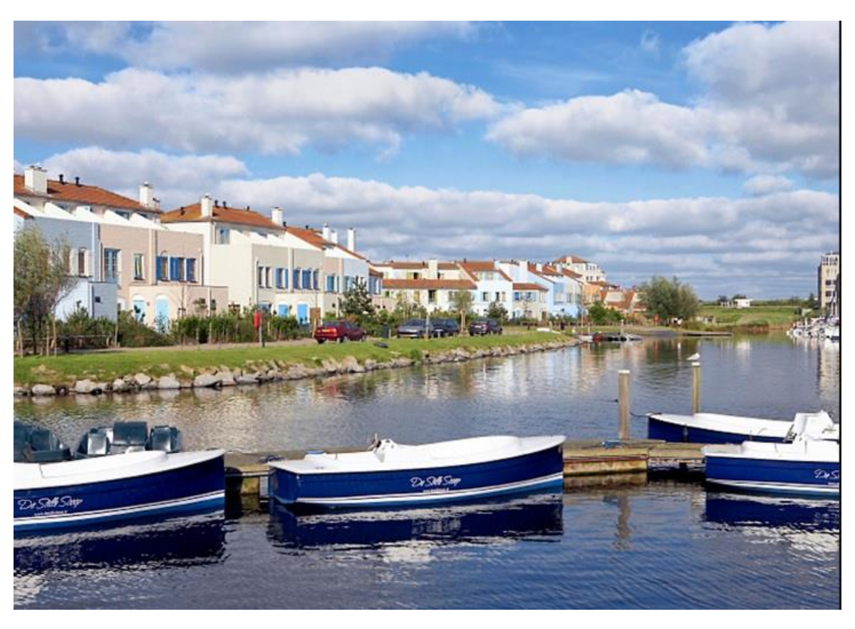
Apartments are located directly near the water; most of them with launching facilities