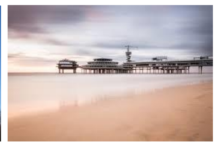
The Hague and Scheveningen: the famous town centre with government buildings, live at the beach with Scheveningen Pier, Museum Mesdag