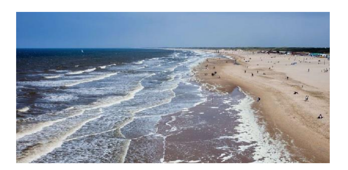
.....from the marina it is a 1km walk to a beautiful (free) north-sea beach