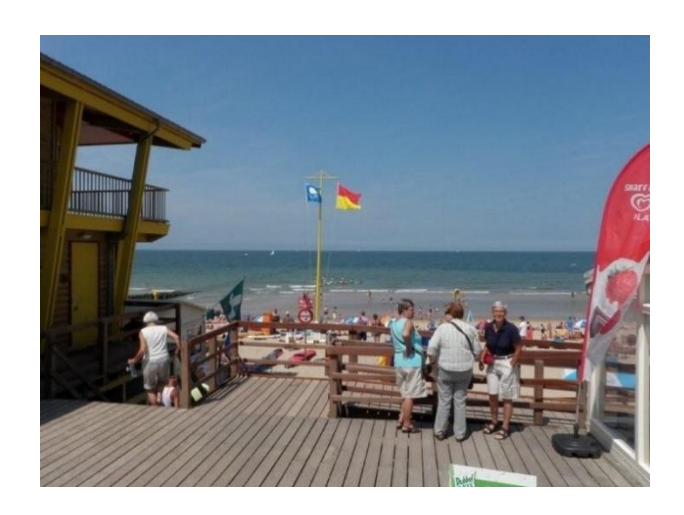
A beach, with has all facilities