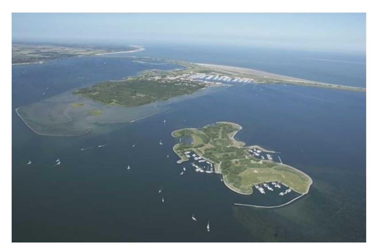
An overview on the race area