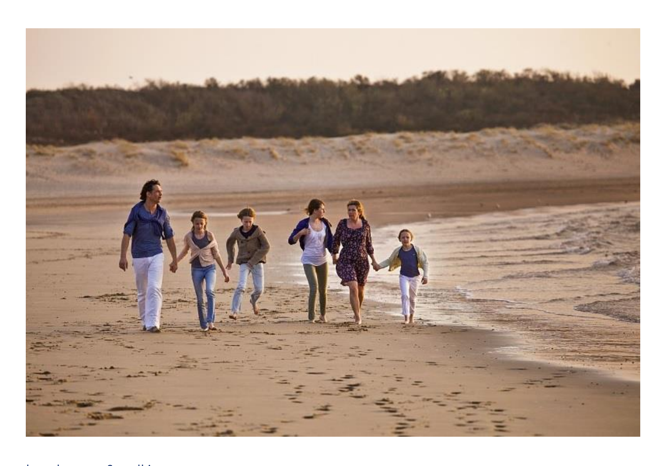
beach tours & walking