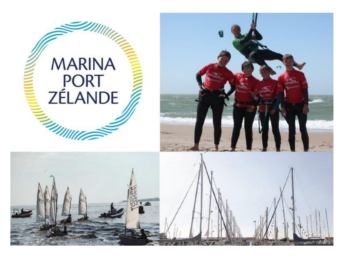
A multifunctional marina: sailing, diving, surfing, kite-surfing