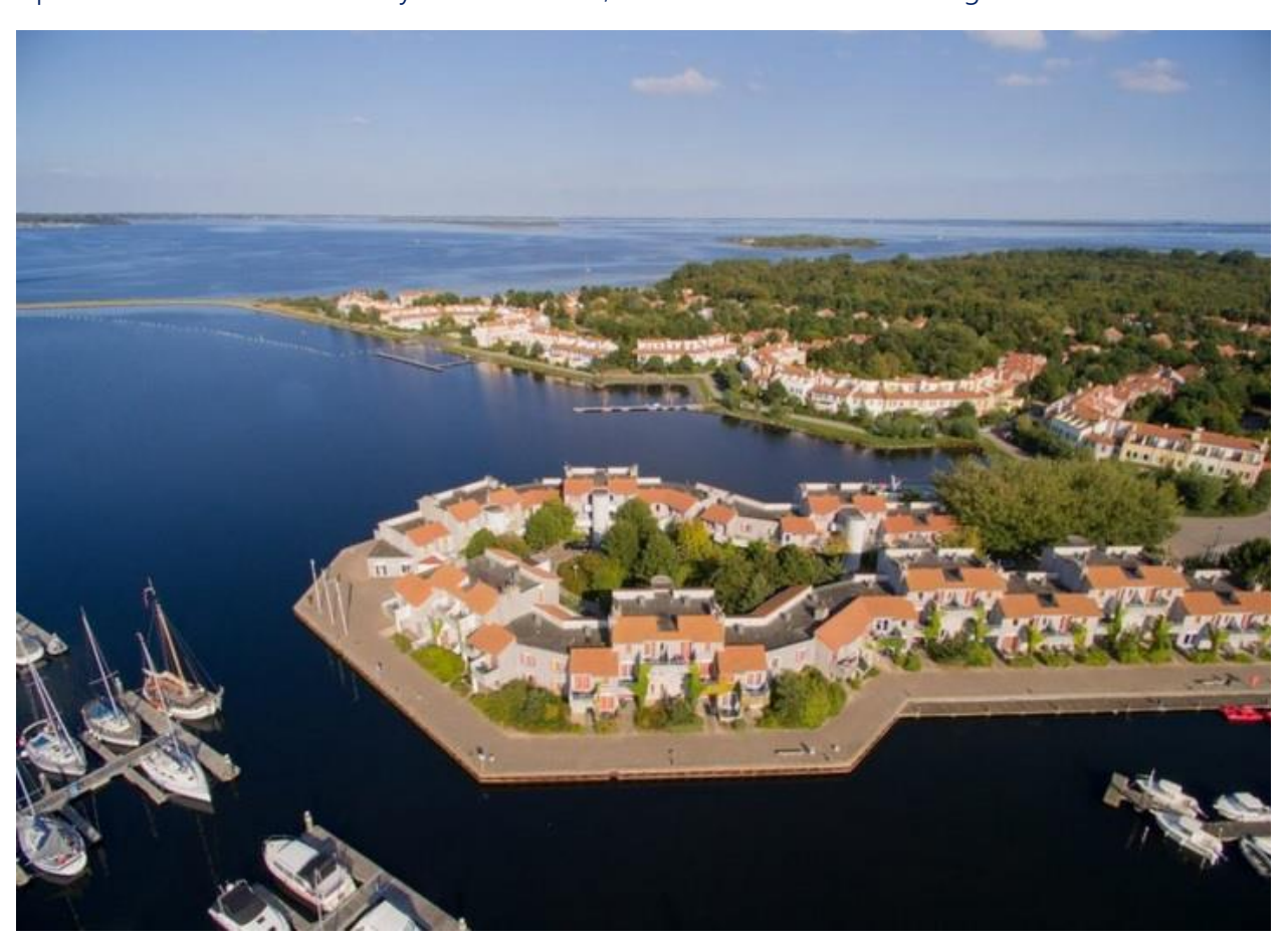
A friendly resort for sailors and their family